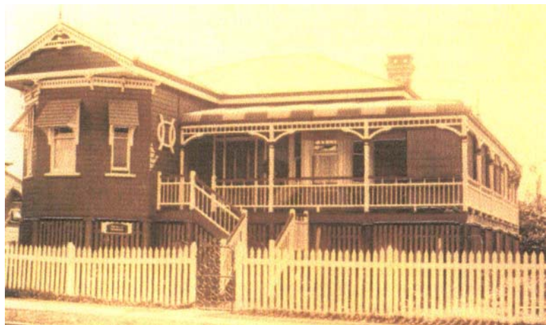
Belvedere, Florence Street, still standing today