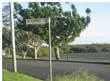
Wynnum North Esplanade