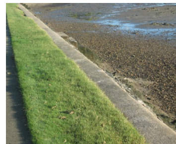
Along the sea wall