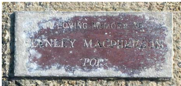
In loving memory of STANLEY MACPHERSON "POP"