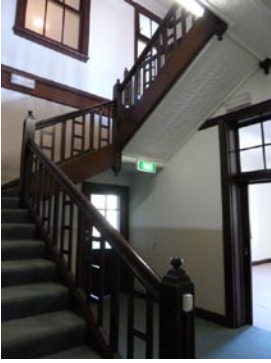
This is the main staircase inside Mt Carmel Convent at 199 Bay Terrace Wynnum.

The convent, a home for the Sisters of Mercy, was blessed and dedicated on 8 August 1915 by Archbishop Duhig. The building was designed by F R Hall and R S Dods and cost £8,000 to build. The Sisters of Mercy had been visiting Wynnum since 1903 when mass was celebrated in the Shire Hall. In 2011 the Convent is empty and for sale