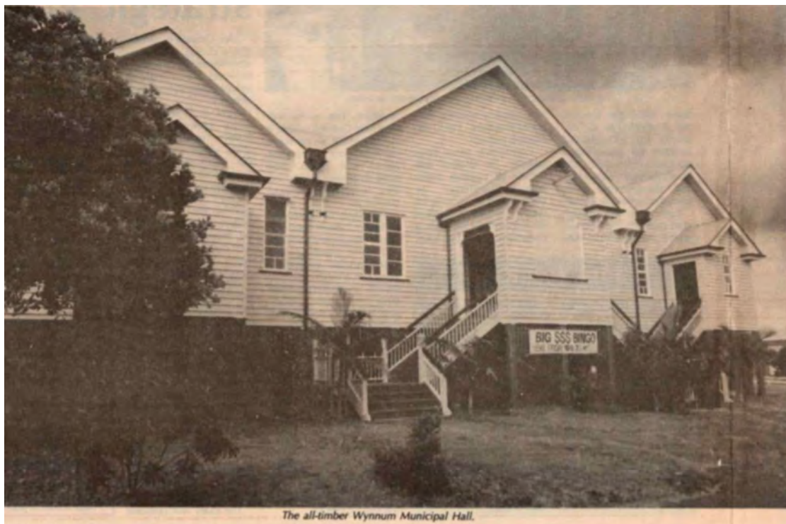
The all-timber Wynnum Municipal Hall.

Originally a school of arts – a place where people could take classes in the arts – the Wynnum Municipal Hall was built in 1915.