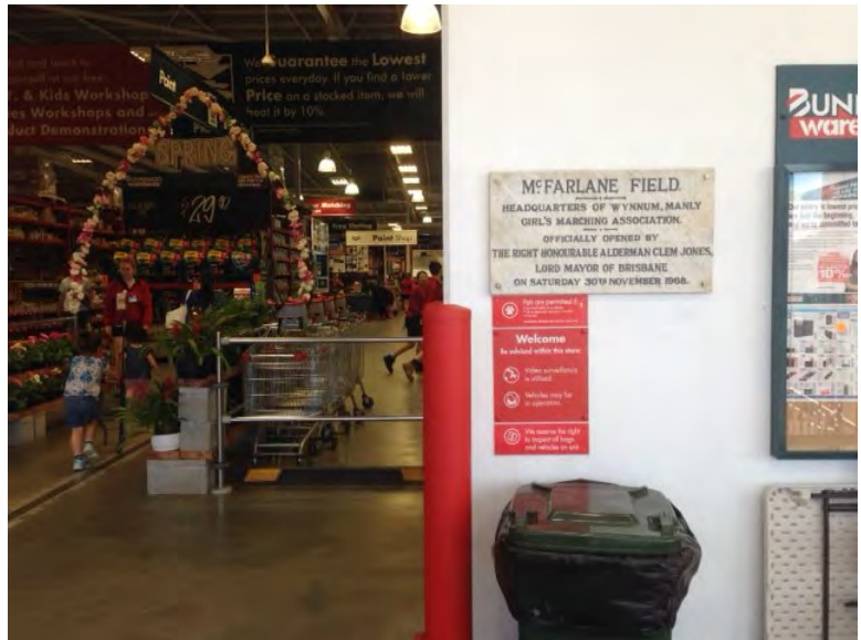
Main Entrance to Bunnings, ManlyWest.