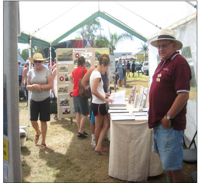
The Society's display on 26 January in Bandstand Park