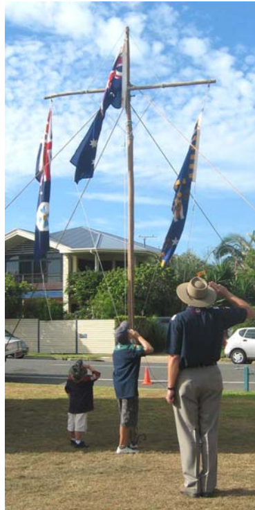
Opening Ceremony 26 January 2010