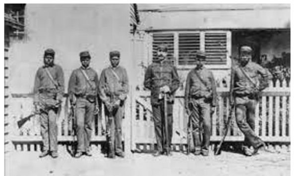
Native Police tracking Kelly Gang 1879

The Native Police in future Queensland started in the late 1840s and included European-descent officers and First Nations troopers. Lieutenant Frederick Walker was the Native Police Commandant from 1848-1855. Walker recruited the first of the First Nations troopers in 1848; between 1848 and 1850, recruits hailed from the south of the country; between 1851 and 1852, local recruits were dominant. Lieutenant Walker supervised the growth of the force until he was dismissed in 1855.