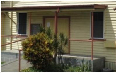
Manly Lota RSL Hall 184 Melville Terrace Manly