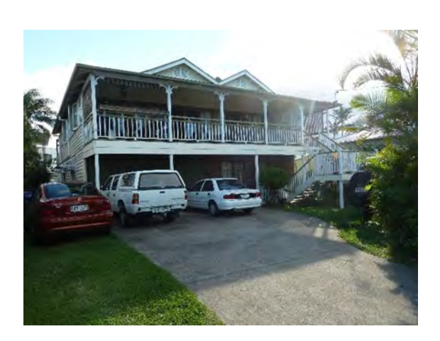
Here is the former site:-