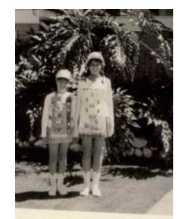
My sister in Mermaids uniform and me in Coronets uniform (with our medal sashes)

When I was about 14, my parents' marriage began to disintegrate and my sister and I resigned from the marching girls thereby ending a memorable period of my life. However, all our long-suffering neighbours were probably so thankful when we resigned. No more hassling them with raffle tickets and other fundraising ventures and, most importantly, no more blaring marching music and whistles constantly blowing!