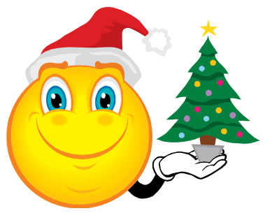
Tickets are only $1.00 each or 3 for $2.00.

Raffle: To celebrate Christmas, a Christmas hamper is being raffled this month. Many thanks to everyone for the donations and to Sandra Wheeler for putting it all together.