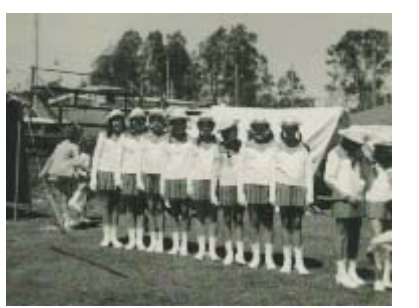
Coronets lining up to have uniforms checked before competition