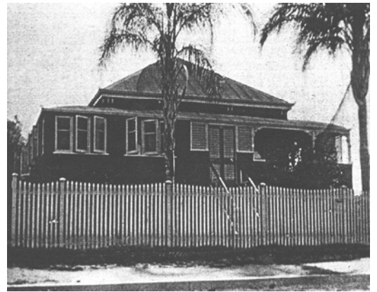
79 Carlton Terrace Wynnum