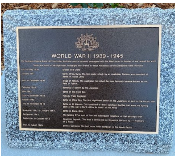
World War II. 1939 - 1945

Behind the Soldier Memorial there is a buried Time Capsule.