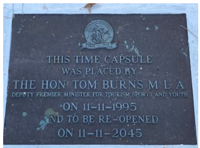
To be opened on 11/ 11/2045 Who will be there?