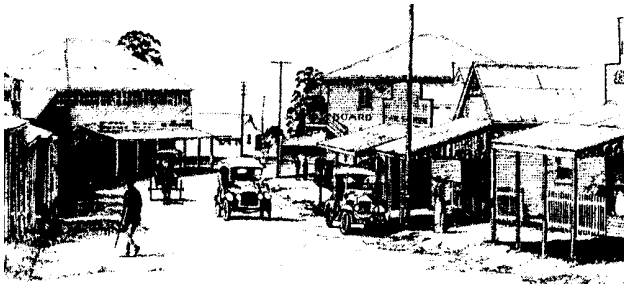
Cambridge Parade Manly Circa 1920