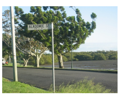
Wynnum North Esplanade