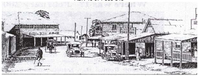
Cambridge Parade Manly Circa 1920