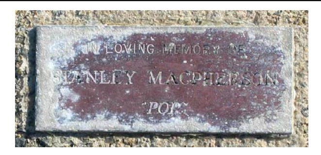
In loving memory of STANLEY MACPHERSON "POP"