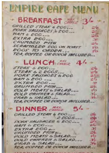
Empire Café Menu