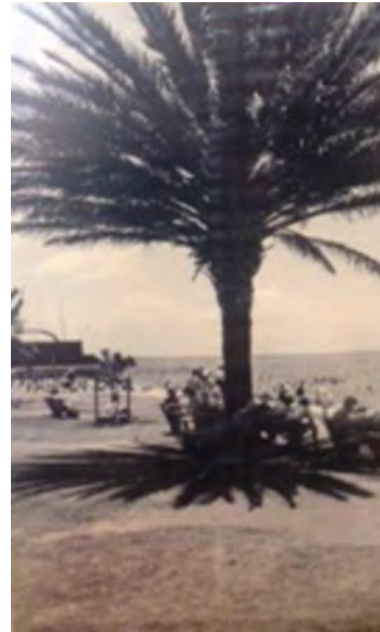
The picture hiding the Menu