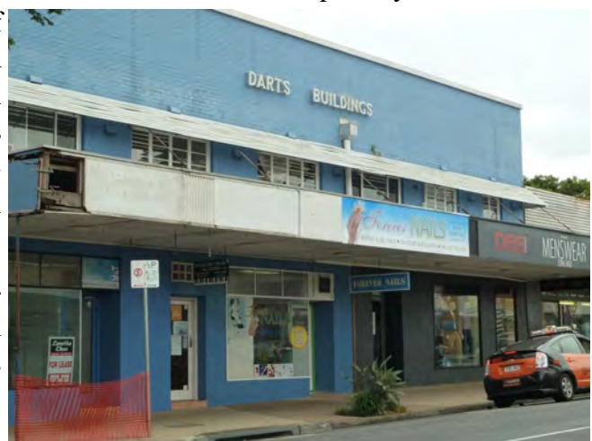
Darts Building in Edith Street, the lettering now covered with brown slats.