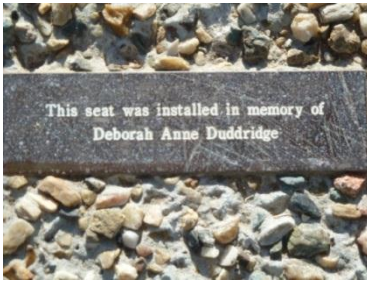
Seat at Darling Point