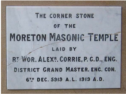
The Masonic Temple at Tingal Road The corner stone is found on the left rear corner of the building.