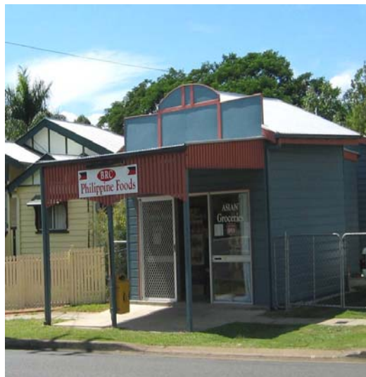
Shop with a later trader