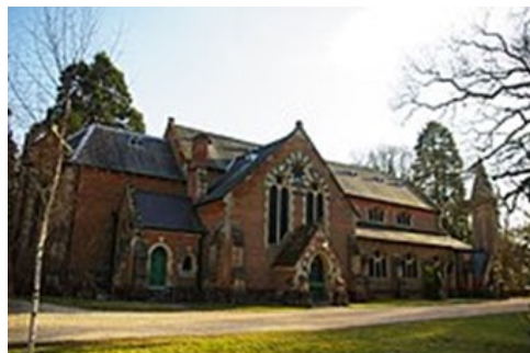
St John's Church Hartley Wintney

Armistice Day is commemorated every year on 11 November to mark the armistice signed between the Allies of World War I and Germany at Compiègne, France, for the cessation of hostilities on the Western Front of World War I, which took effect at eleven o'clock in the morning—the "eleventh hour of the eleventh day of the eleventh month" of 1918.