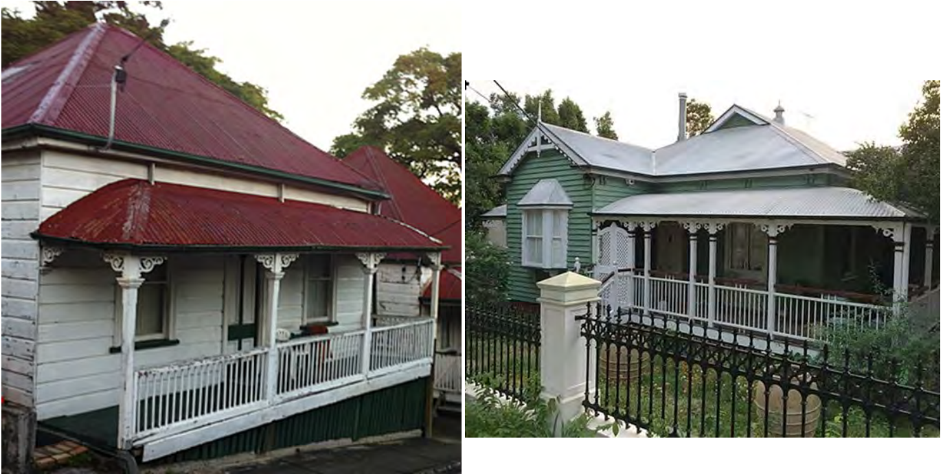
An Asymmetrical Colonial with L-Shaped veranda.

Cottages built in the late 1880's through to 1900's and beyond, again Late Colonial are recognised by the "Pyramid" or "Short Ridge" roof and gave rise to the "Queenslander", as we know it. The house was perched on timber stumps, with ant caps, and had a square configuration with an internal layout of two bedrooms, a sitting room and a kitchen. The street frontage had a separate veranda roof, which sometimes extended around the sides of the house. The steeply pitched corrugated roof, separate veranda roof, and often a brick chimney, set these houses apart.