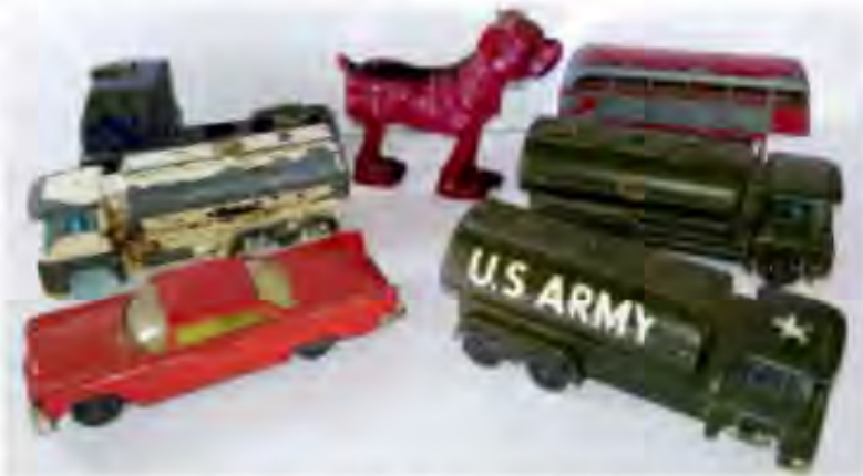
The toys from the wall.

name of Mary Ellen O'Shea listed as owner of the house, the Wright family it seems had moved on. The toys in wall were finally liberated a few decades later, but the name of the little boy who lost them remains a mystery.