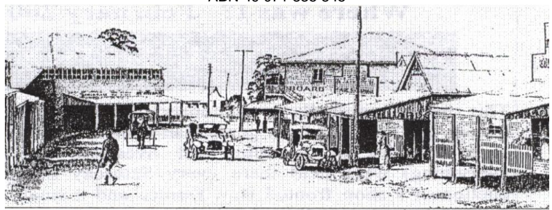
Cambridge Parade Manly Circa 1920