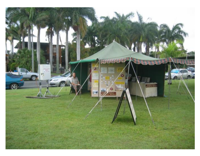
Australia Day – Monday 26 January 6.00am – before the crowds came for their breakfast

Many thanks to members who came down to the foreshore on Australia Day. The number of visitors to our tent was greater than we have ever had before. The main topic of interest always seems to be that of seeking the history of ones house, though we did add a few more births to our "St Kilda" Register. We thank the RSL Fishing Club for the loan of their tent once again.