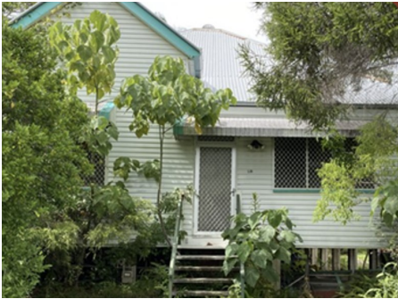
118 Berrima Street, Wynnum