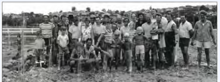
1973 working bee of members of MBTBC for club ramp