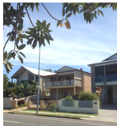
The site of Rose Bay Lodge today