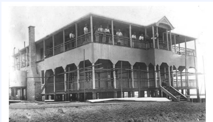
This photo shows workmen before the completing of Ingleston's Boarding House, Cnr Bay Terrace and Charlotte Street Wynnum in the early 1900's. On this corner was one of the first lawn tennis courts. Sadly fire claimed this building in 1947.