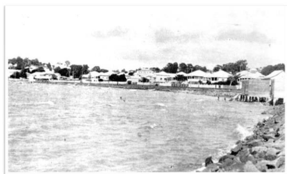
Manly beachfront looking from Darling Point to Cardigan Parade in the 1920's shows a private bathing box on the right coming out from a sloping stone wall. Council records in 1917 say private bathing boxes were still very popular. Residents were allowed to maintain the boxes with a payment of a yearly fee of 10/- per year.