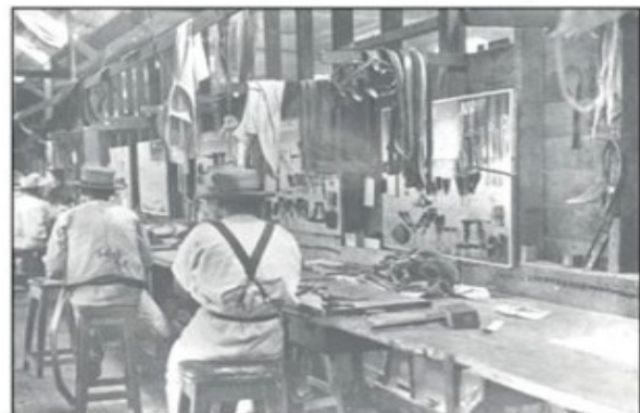
Boot makers' and saddlers' shop

In this tidy and organised boot-makers' and saddlers' shop the prisoners faced back to the camera. Prisoners were never photographed 'face on' This photo taken in 1912