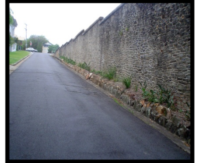
"The Great Wall of Manly"

Still watching this pretty girl in this pink dress what was about happen stayed with me for the next sixty four years of my life. She seemed to hesitate or maybe even look back probably at her brother and then just suddenly fell off the wall half way along Falcon Street.