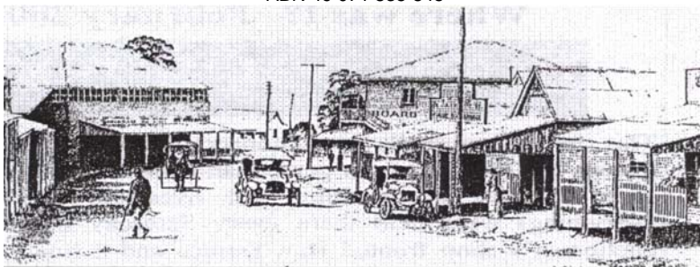
Cambridge Parade Manly Circa 1920