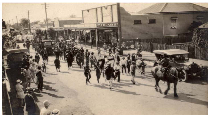
James Hamlet's truck decorated with trees for Spring Parade procession Does anyone know what year it is likely to be?