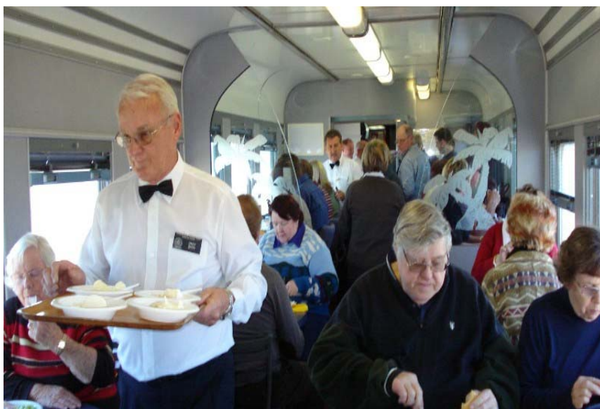
Lunch in the dining car