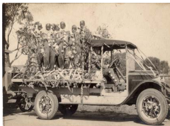
Another float – year unknown