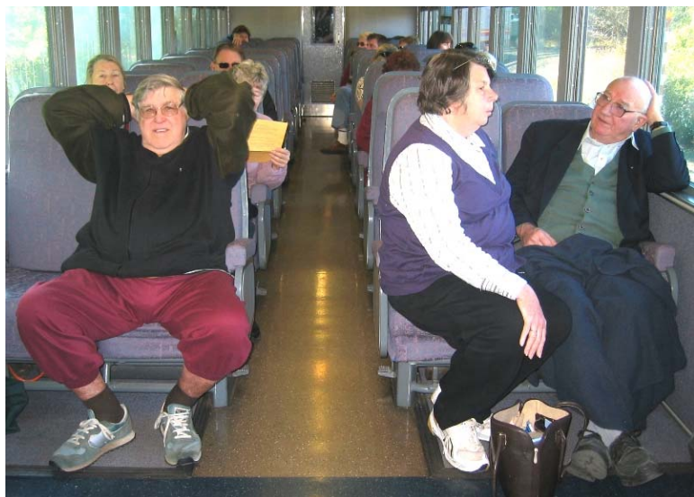
Are we there yet? Relaxing on the way to Stanthorpe