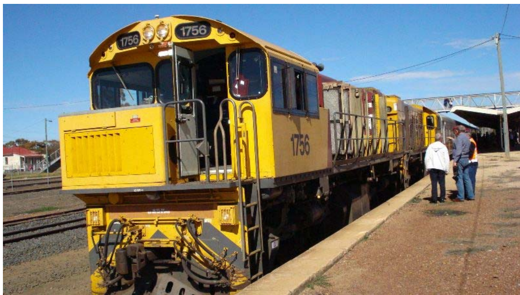
The "Winelander" engine