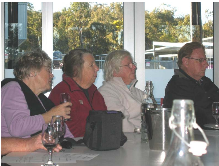
Wine tasting at the Wine College, Stanthorpe