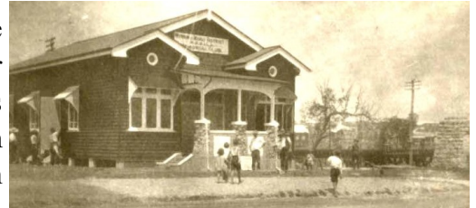
The first RSL Memorial Hall