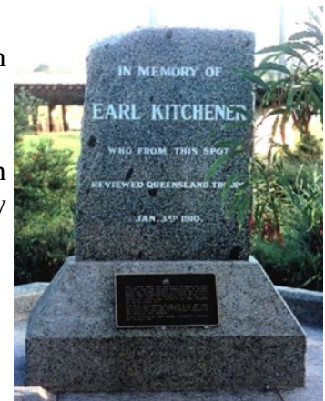
New Cairn with gardens.

Lord Mayor Jim Sorley unveiled the new Cairn on May 2 1992.