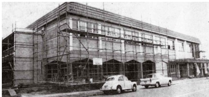
1973 Two storey building on the corner of Tingal Road and Colina Street

More land was purchased for a significant extension in 1937.