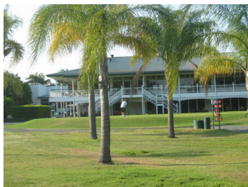
Club House Today