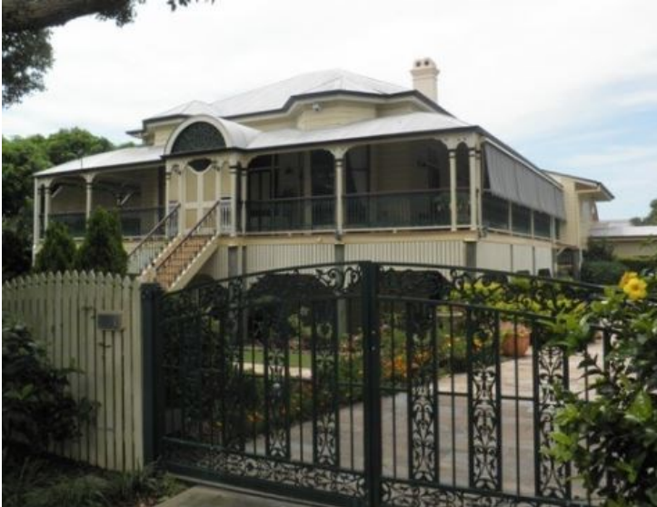
“Tingalpa” or “Stratford House”, 56 Mountjoy Terrace Wynnum

There is a new picture and story every day!