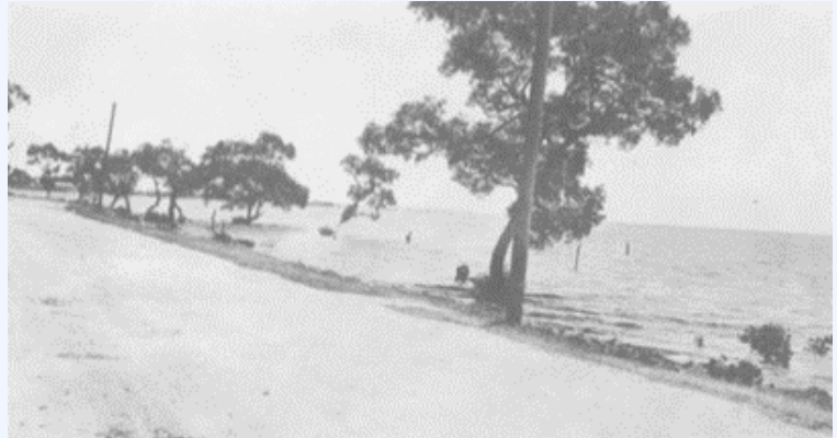
c1920—Lone fisherman in the shallows at the Esplanade at Manly.