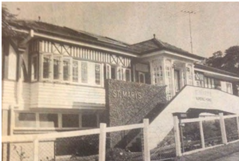
St Mary's Nursing Home, viewed from Nelson Parade