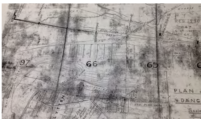
Diagram of Range through the mangroves at Wynnum North

The Range was planned to stretch from the "Grassy Esplanade" near Prospect Street through a pathway made in the mangroves, past Crab Creek and Whyte Island to "Targets on a Raised Gallery".