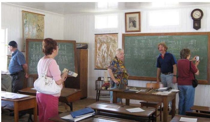
School room at Carbethon Village