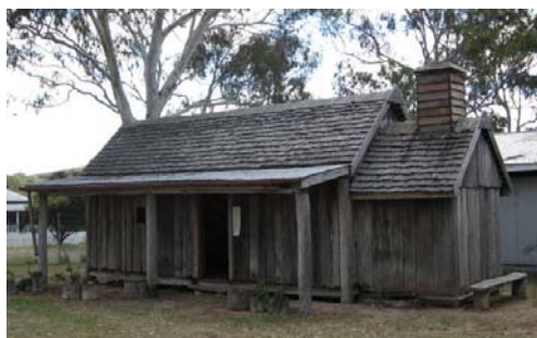
Slab hut at Carbethon Village