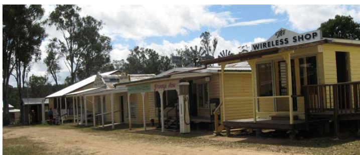
Buildings at Carbethon Village