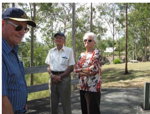
Enjoying the tranquillity at Wivenhoe Dam