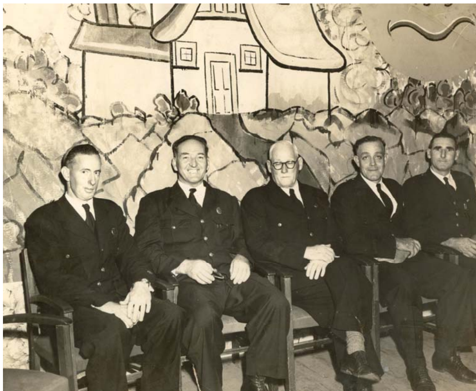
Wynnum Ambulance Officers