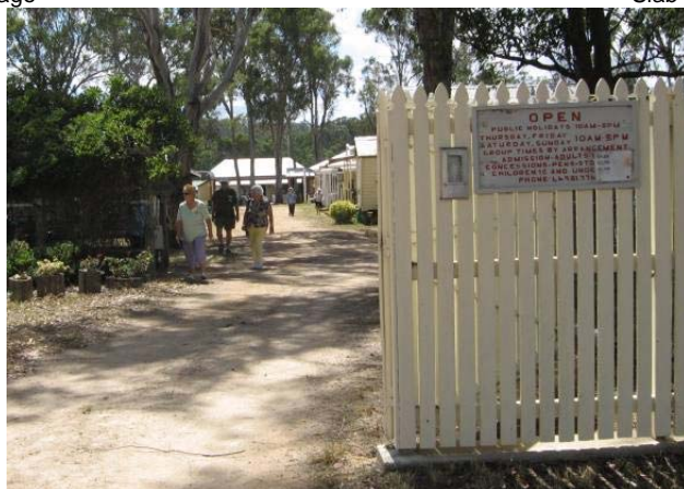
Entrance to Carbethon Village