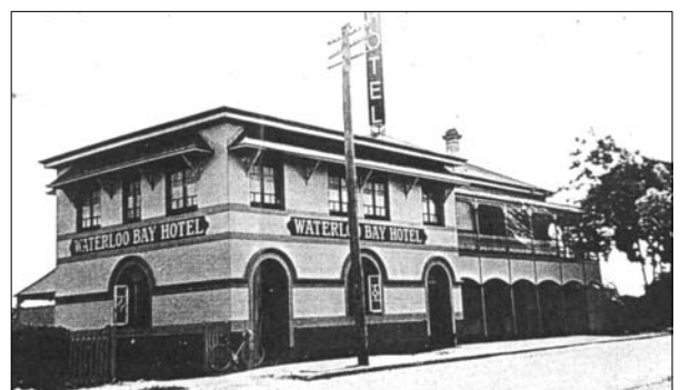
Waterloo Bay Hotel