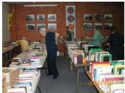
Band of WMHS volunteers busy setting up