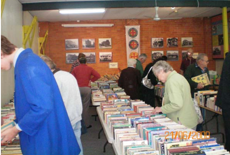
Happy Bookfest customers

Saturday, 21 June 2008 was the 2nd annual Wynnum Manly Historical Society Bookfest held at the Ambulance Centre Auditorium.