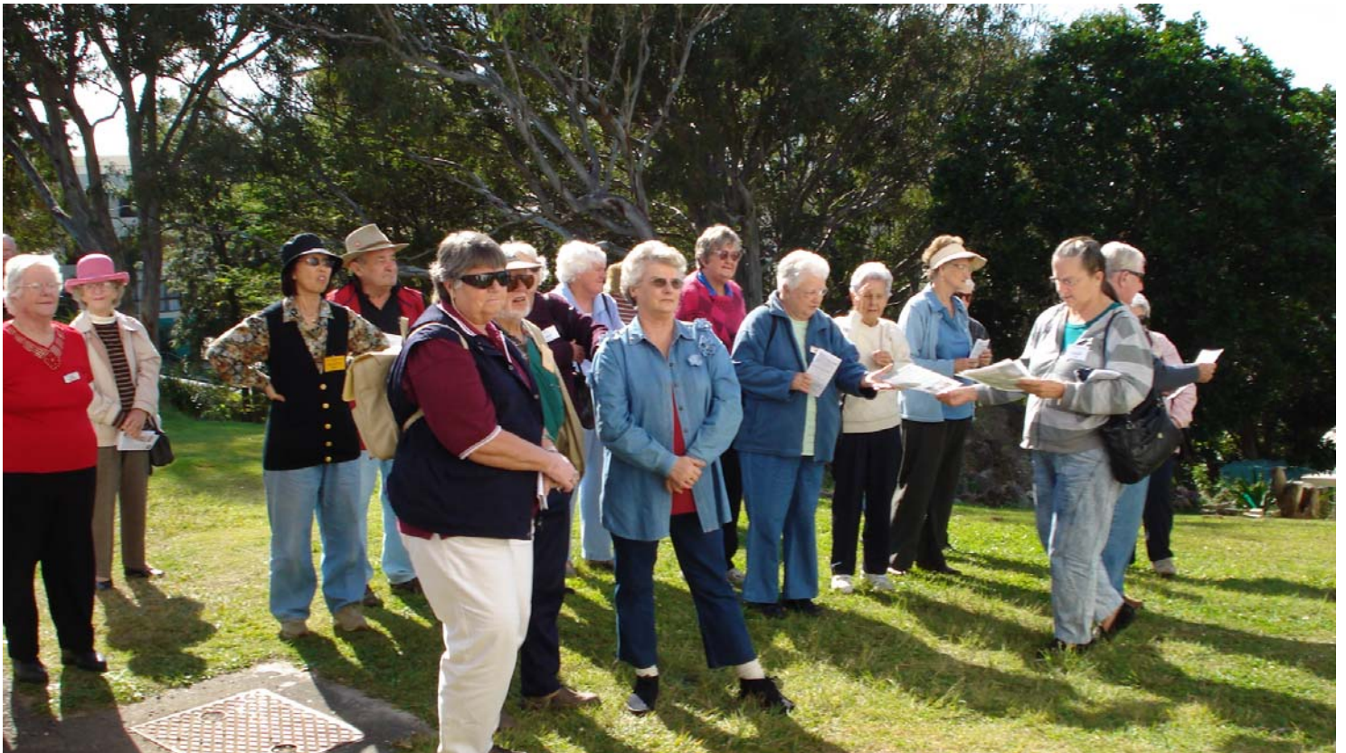
Some of the Society's members at the Caloundra Lighthouse