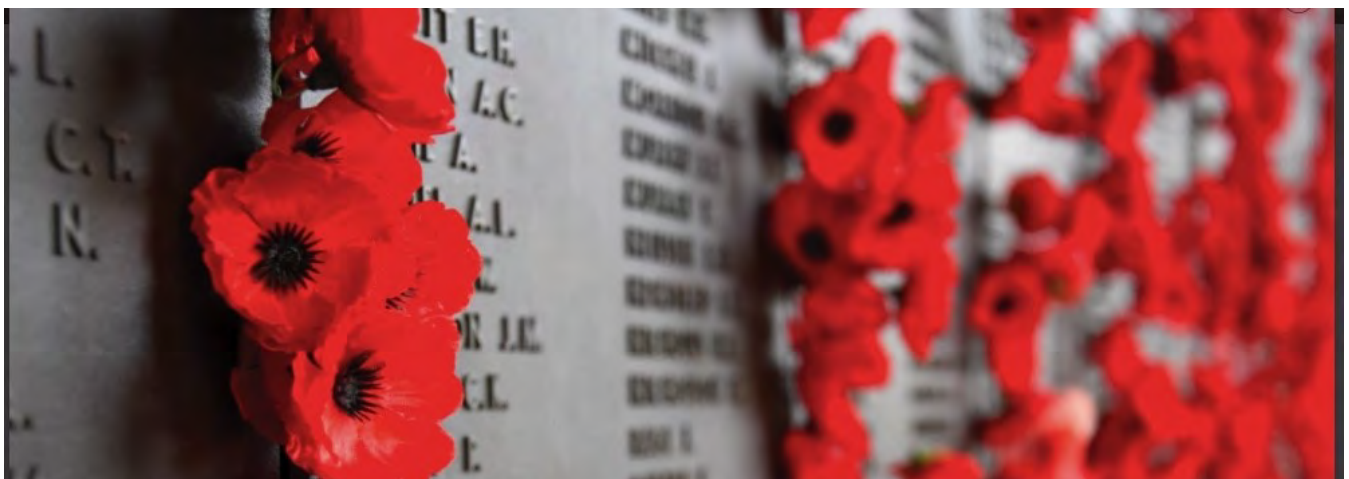
Lest We Forget.

George William Gray was invalided out at the age of 23 due to injuries he suffered at Gallipoli. When repatriation of the Australian Imperial Force was completed in 1920, 264,000 men and women had returned to Australia, of whom 151,000 were deemed "fit", and 113,000 "unfit" (3)