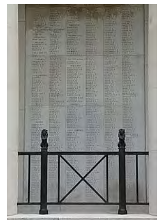
One of the panels of names of missing dead at Menin Gate

Information obtained from Queensland Births Deaths Marriages Index; Australia Electoral Rolls; National Archives of Australia; State Library of Queensland, Commonwealth War Graves Commission.