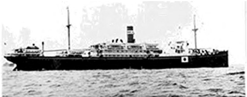
Photo of the Montevideo Maru taken before WW1 when it operated as a passenger and cargo vessel travelling mainly between Asia and South America