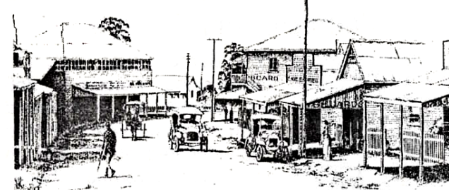
Cambridge Parade Manly Circa 1920