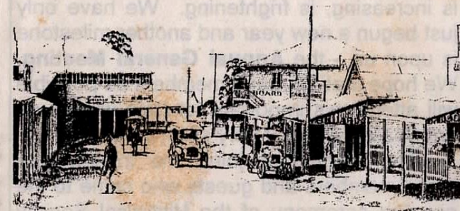
Cambridge Parade Manly Circa 1920