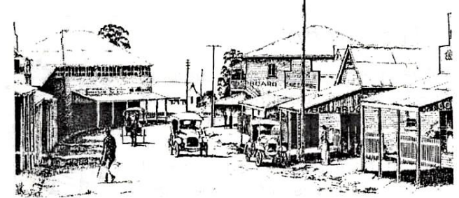
Cambridge Parade Manly Circa 1920