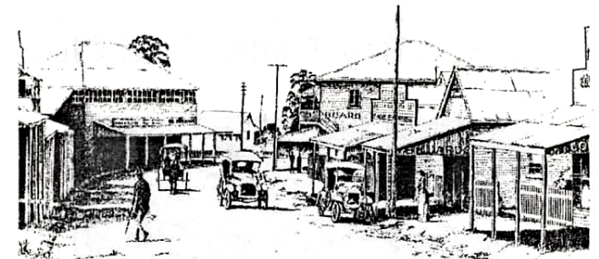
Cambridge Parade Manly Circa 1920