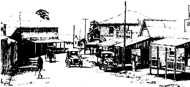
Cambridge Parade Manly Circa 1920