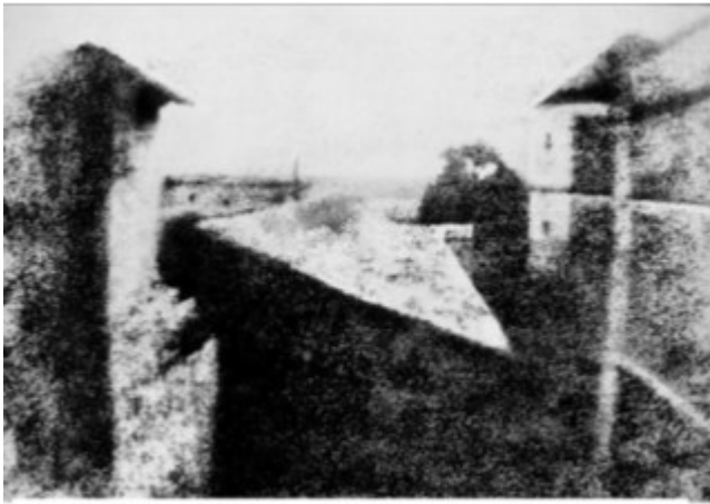
First Photograph – in Bitumen from 1827

The first photograph used an unlikely material – bitumen. Bitumen has the property that it hardens when exposed to light. In 1827 a Frenchman called Nicéphore Niepce mixed bitumen powder with water to create a thick material that he slathered over a metal plate and dried over a flame. When the bitumen was dry, he placed the plate into a simple box camera looking out of the window of his apartment for a whole day. Washing the result with white petroleum dissolved the bitumen that had not been hardened by light. The view shows both sides of a wall in sunlight because of the long exposure.