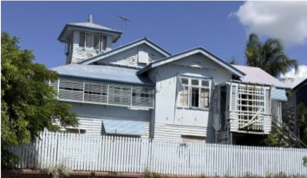
”Tower house”, 17 Kingsley Terrace, Wynnum.

(I addressed this case, but a clear solution was not given at the gathering, of course.)