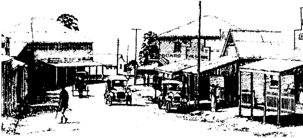
Cambridge Parade Manly Circa 1920