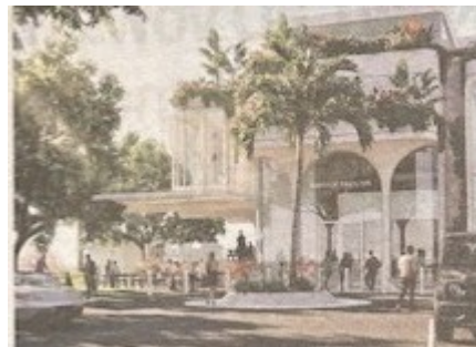
Site - The Fish Markets at Wynnum Creek

See page 3 of the Redland Bayside News (April 2 - 8) for the full story!