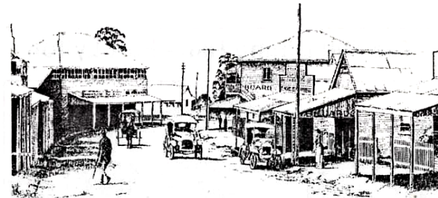
Cambridge Parade Manly Circa 1920