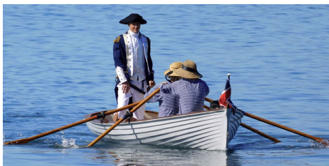
Arrival of "Matthew Flinders"