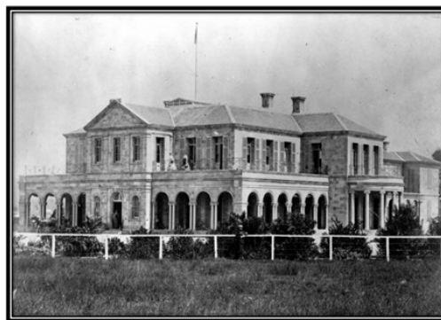
Government House, ca. 1869.

Old Government House was designed by the newly-appointed Government Architect Charles Tiffin with construction starting in October 1860. The design incorporated a number of adaptations to the ‘Greek revival’ style to suit South East Queensland’s semi-tropical climate. The building was completed by Joshua Jeays in May 1862 at a total cost of £17,000 using large quantities of sandstone, which was floated down the Brisbane River from Goodna, as well as volcanic rock (known as porphyry) from Windsor, red cedar, hoop pine and cast iron.