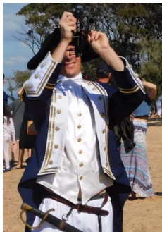
Raising of the Using a Sextant