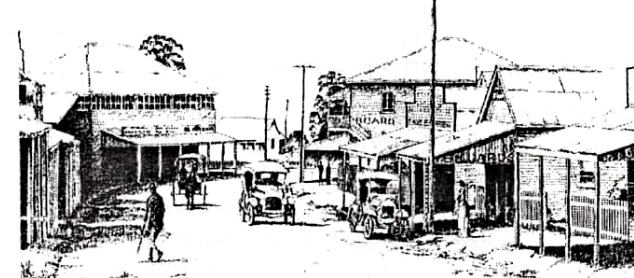
Cambridge Parade Manly Circa 1920