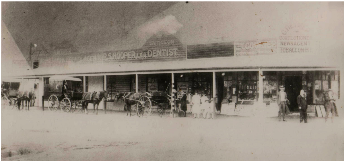
The three Shops in Florence Street