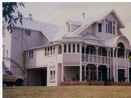
Large extension on southern side of the building 1910

In 1910 a large extension was built onto the southern side of the school, towards Florence Street, which allowed for an increase in pupil admissions.