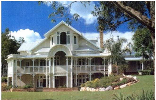
“Moreton” at Pullenvale

The ground was cleared and Franklin’s Shopping Centre emerged, a three-storey building. On the ground floor were shops, the Wynnum Shopping Centre, with two floors of small Units above. Franklin’s store became the IGA grocery store, then sold. Various food and drink establishments now line Bay Terrace. To the rear there is a gymnasium. (This is the site proposed for a 29-storey building in 2022.)