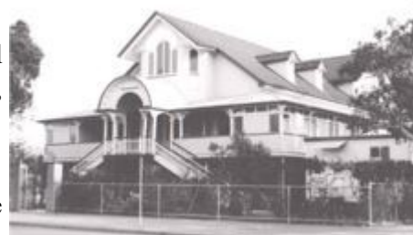
Moreton Bay Girls High School. Post 1910

This building work, from an educational and a health point of view, allowed claim to be made that the school was one of the best secondary schools in the state.