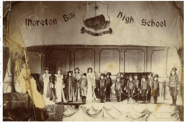
An early dramatic production