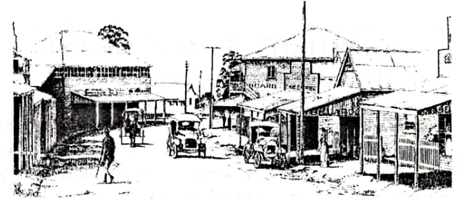
Cambridge Parade Manly Circa 1920