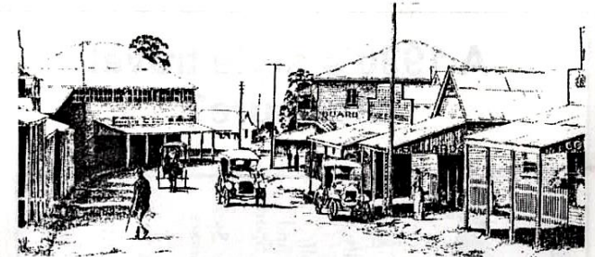
Cambridge Parade Manly Circa 1920