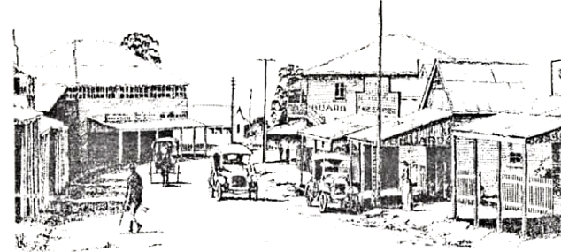
Cambridge Parade Manly Circa 1920