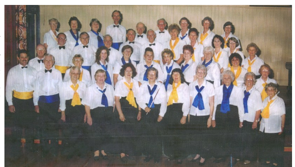
2001 - 75th Anniversary