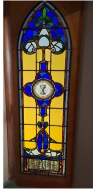
Stained Glass Windows located in Bayside Uniting Church 420 Wondall Road, Manly West

New church was opened and dedicated on 16 November 1991