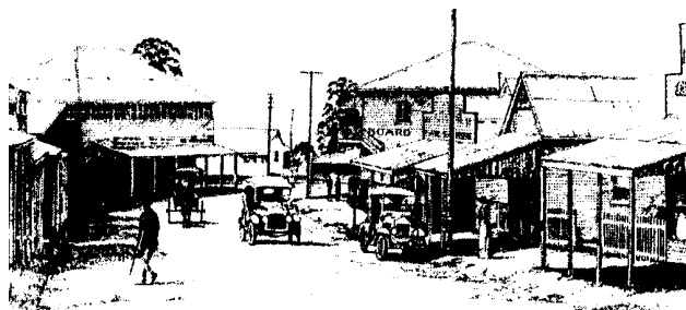
Cambridge Parade Manly Circa 1920