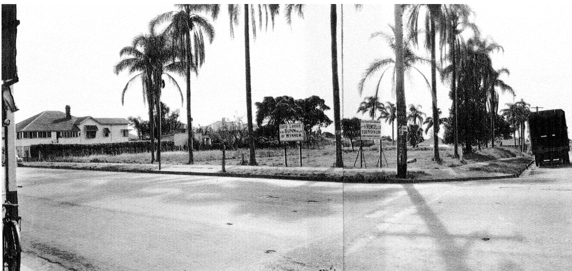
Ingleston Corner at crossing of Bay Terrace and Charlotte Street. 1947 – 1955

In 1957 the corner of Bay Terrace and Charlotte Street was an empty site, left after the burning of “Ingleston” boarding house in 1947. The City Council owned the land - Ingleston Corner.