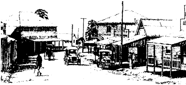
Cambridge Parade Manly Circa 1920