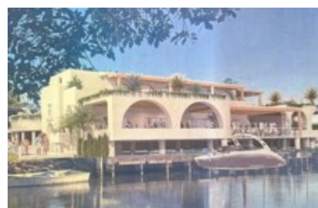
2025 - Artist's Impression

In 2025 "A two- storey, $3m hospitality development was proposed transforming the former Wynnum Creek Fish Market and Ice Works into a modern dining precinct. Designed by Thinktank Architects for "Unlimited Possibilities P/L, the project aims to feature indoor /outdoor dining, a roof top terrace and a takeaway." kitchen providing a vibrant bayside venue."