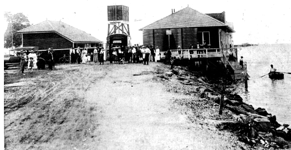
Fish Market and Ice Works. 1925