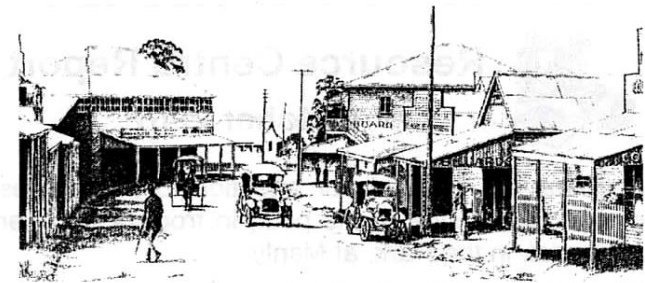
Cambridge Parade Manly Circa 1920