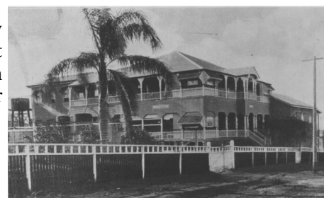
Ingleston Guest House. Pre 1947