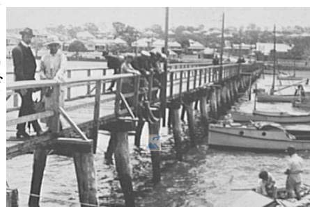
Manly Jetty c.1903

Ian displayed lots of photos during his presentation, including a 1900 photo of Manly jetty with many people promenading and a 1903 photo of Wynnum with electricity poles, dirt roads and a horse and carriage.