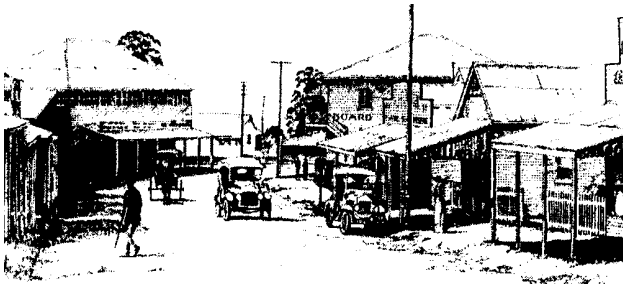
Cambridge Parade Manly Circa 1920