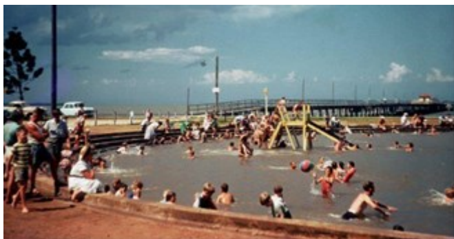
Wynnum Wading Pool, with No.2 Jetty, still as timber. Pre 1958.