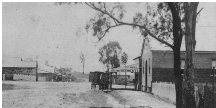
Early 1900's. Stratton Terrace. Russell's General Store and Hall on the right, on the corner of Cambridge Parade.